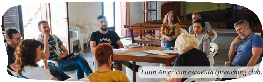
Latin American escuelita (preaching club)